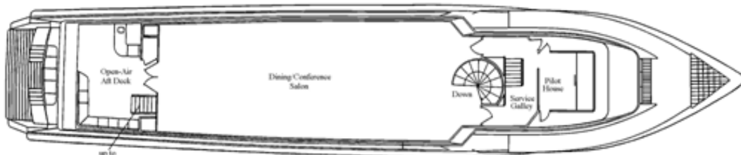
Upper Deck Plan