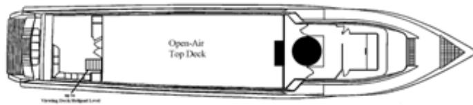
Top Deck Plan